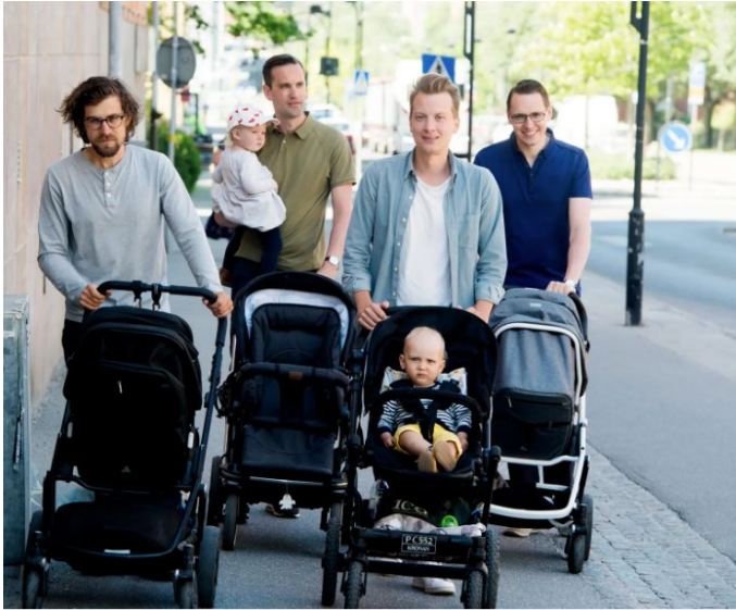
fathers on parental leave.